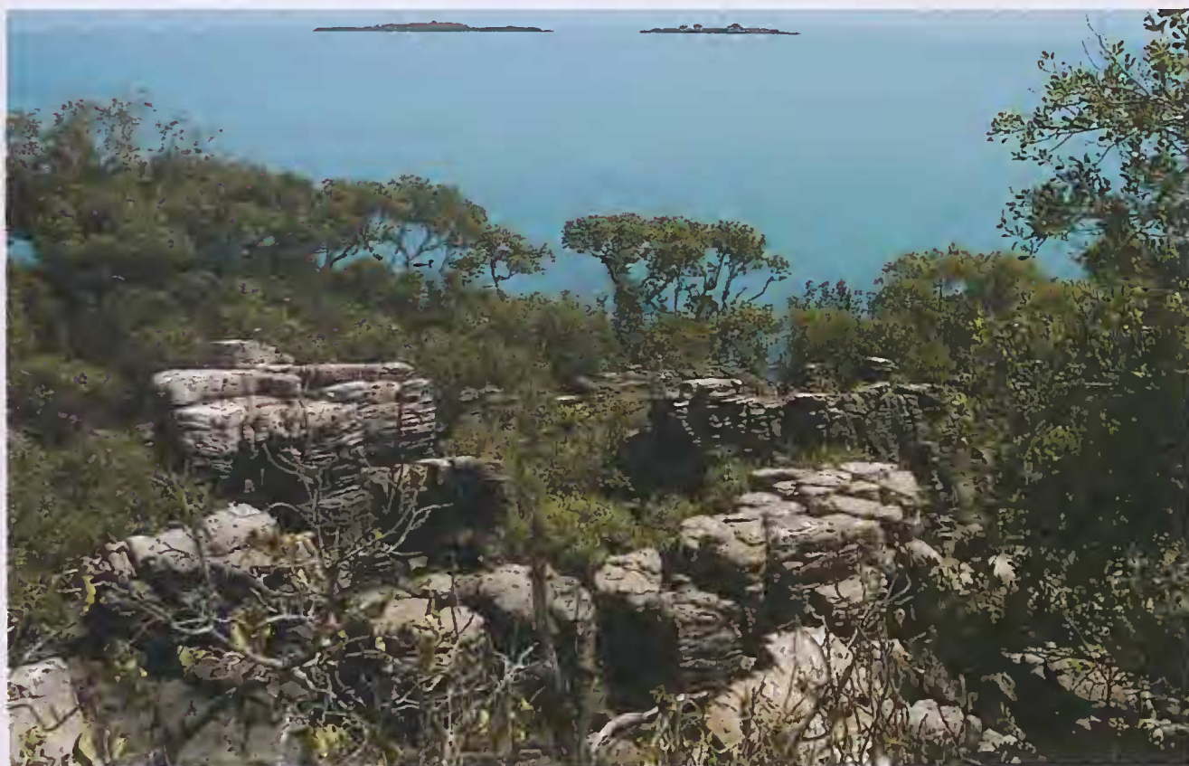
Figure 5. On the top of Wulajarlu Island, looking north at high tide. Blocky quartz sandstone in the foreground, the Egret Islands on the skyline. (Photo Barry Wilson).